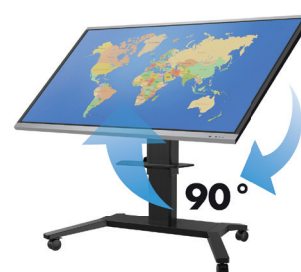
ELECTRIC LIFT & CONVERTIBLE STAND