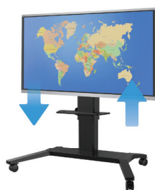
ELECTRIC LIFT STAND